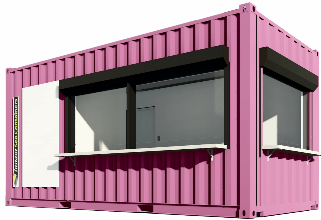
1 3D VIEW NTS

BUILDING DESIGN CRITERIA WIND LOAD IN ACCORDANCE WITH AS.1170.2:2002 REGION A, TERRAIN CATEGORY 2