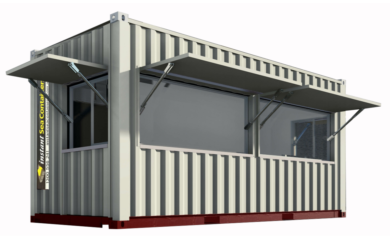
1 3D VIEW NTS

BUILDING DESIGN CRITERIA WIND LOAD IN ACCORDANCE WITH AS.1170.2:2002 REGION A, TERRAIN CATEGORY 2