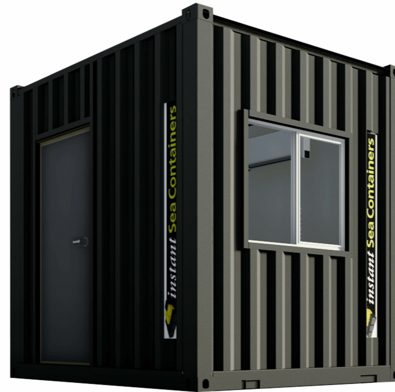
2 3D VIEW 1 : 10