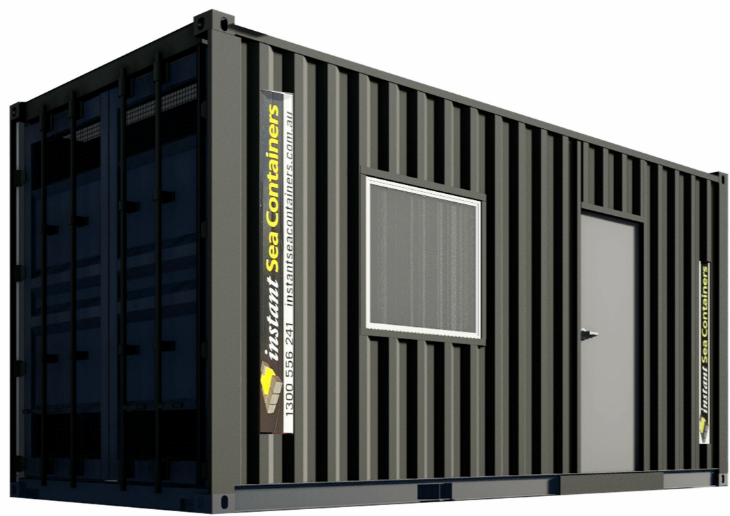
2 3D VIEW 1 : 10