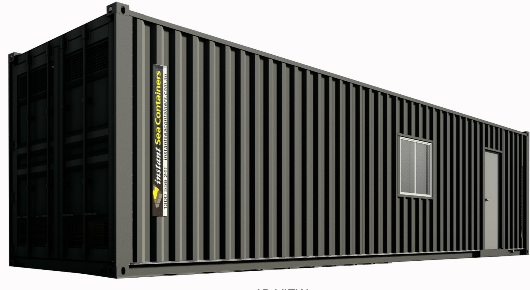
2 3D VIEW 1 : 10