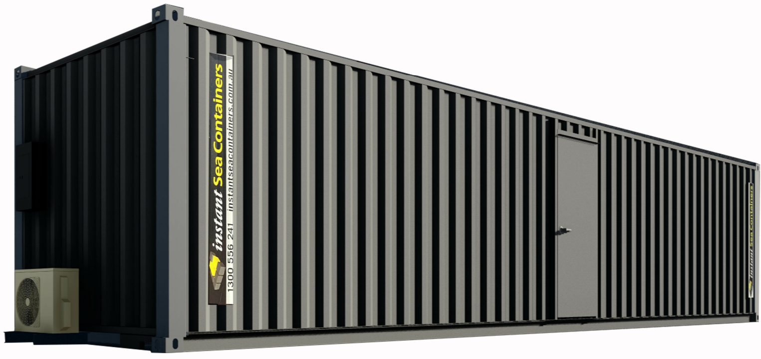
2 3D VIEW NTS