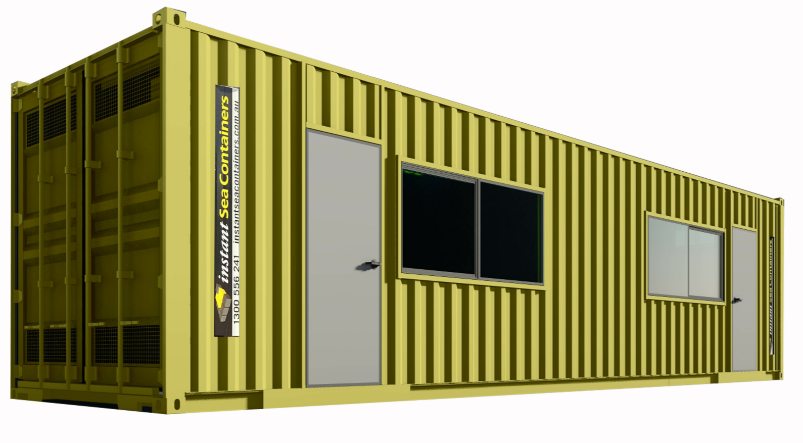
2 3D VIEW 1 : 10