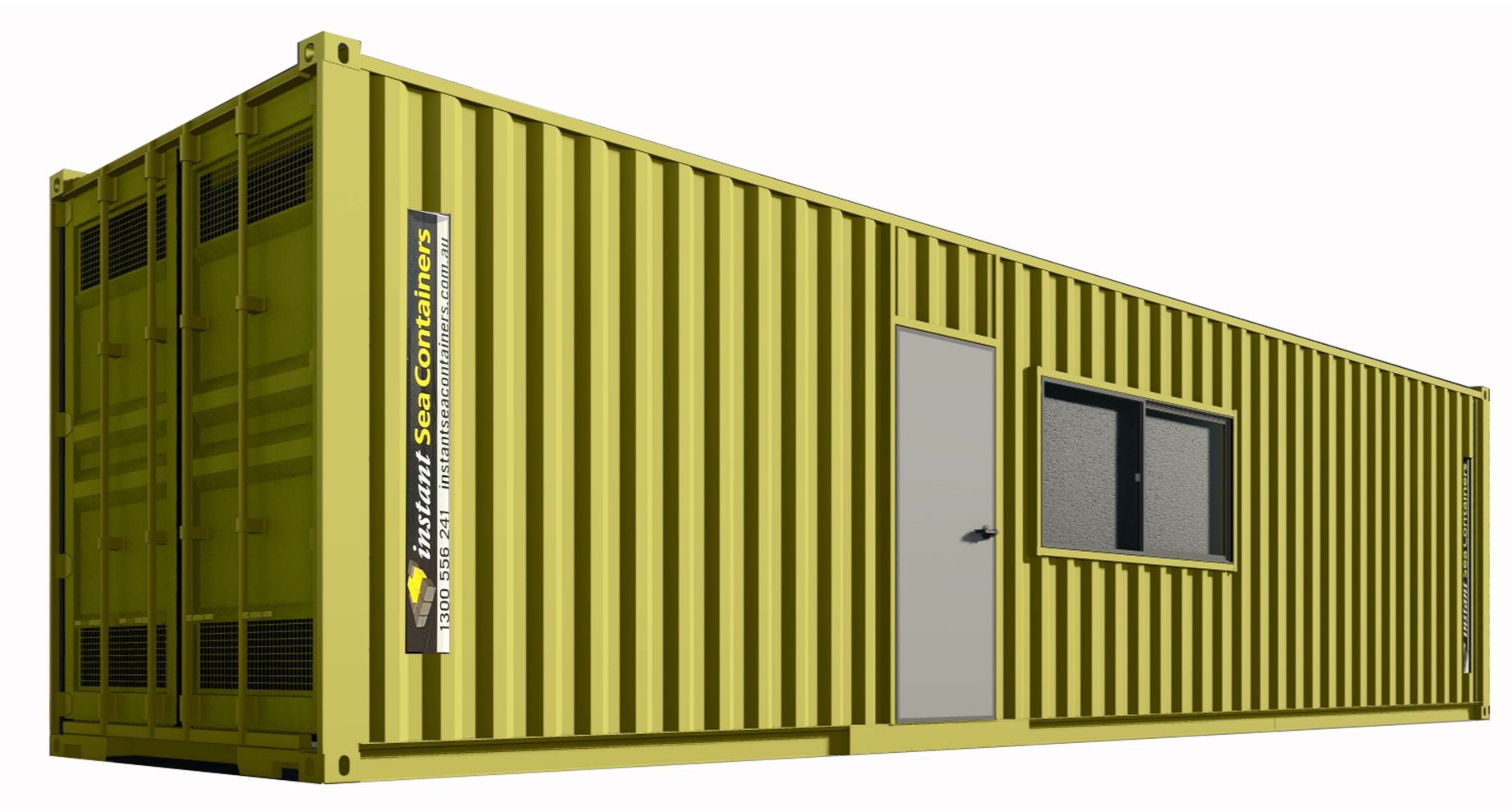
2 3D VIEW 1 : 10 12193