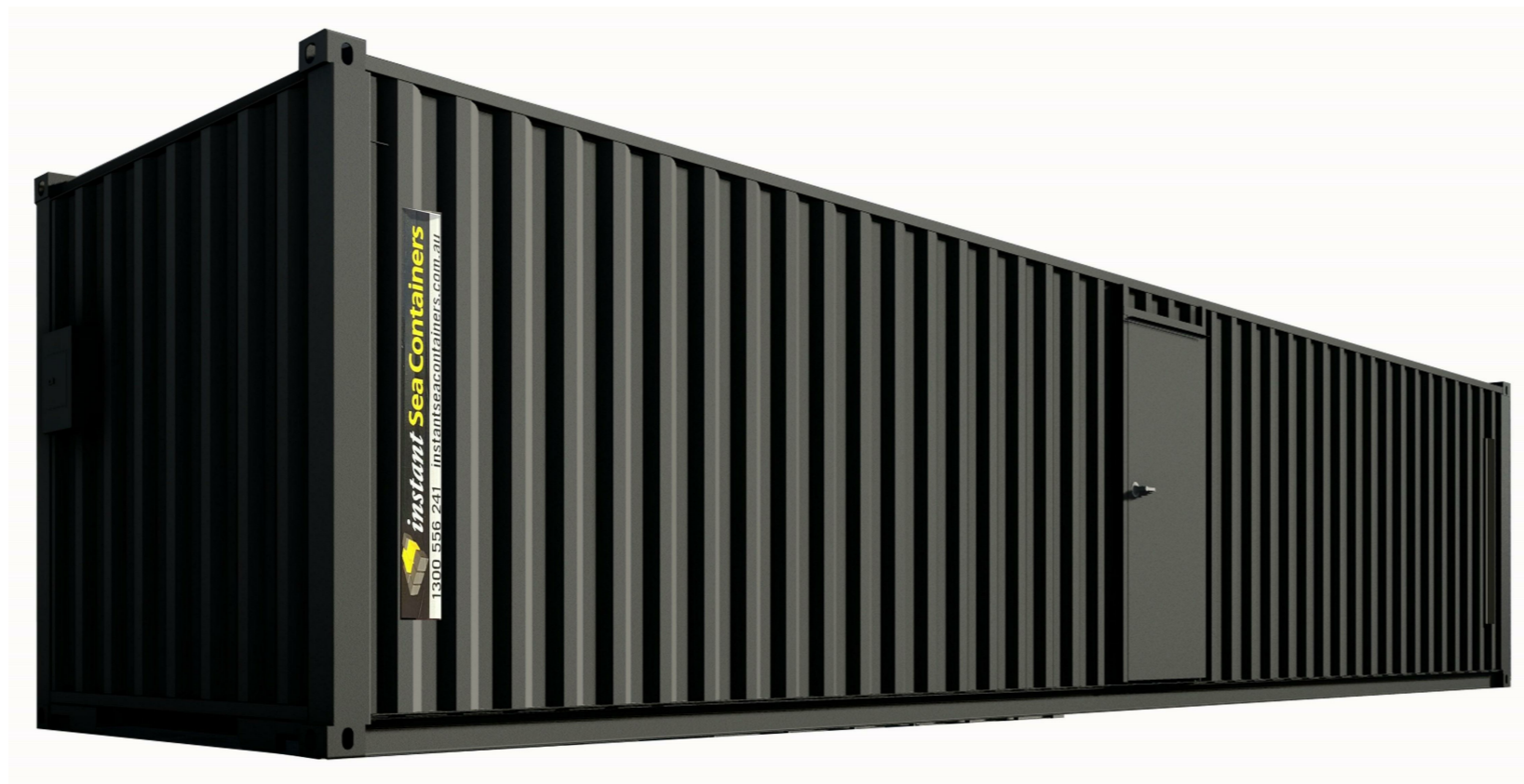
2 3D VIEW 1 : 10