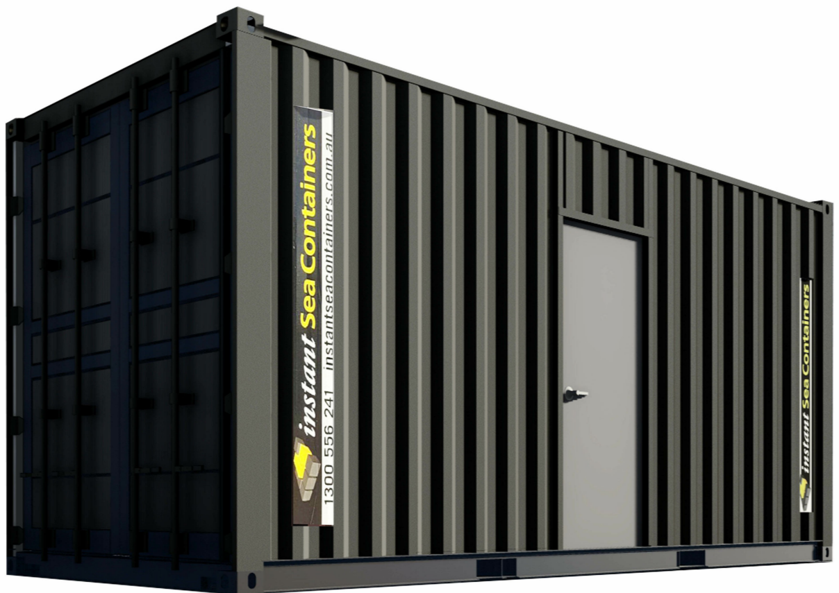
2 3D VIEW 1 : 10