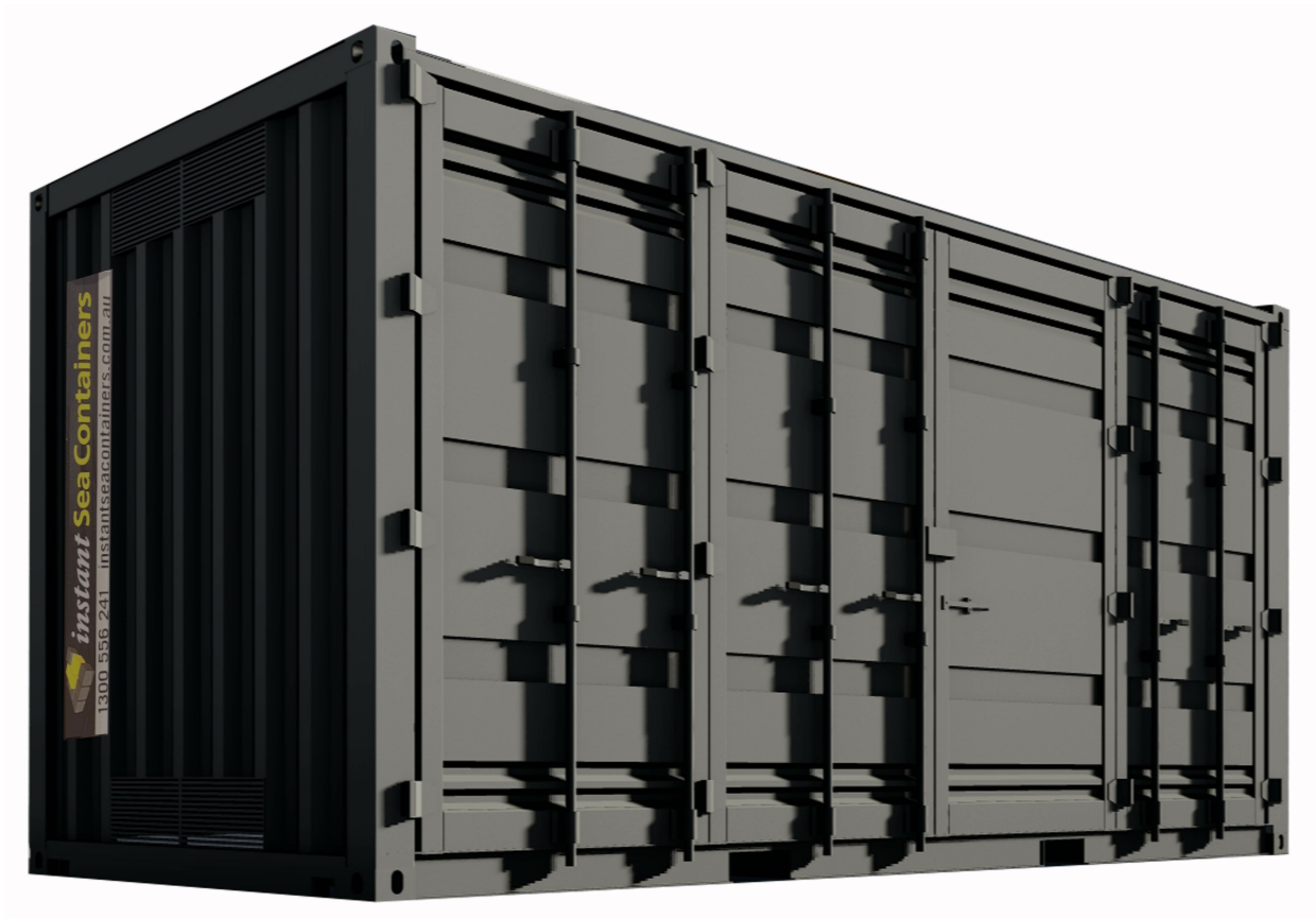
2 3D VIEW NTS

BUILDING DESIGN CRITERIA WIND LOAD IN ACCORDANCE WITH AS.1170.2:2002 REGION A, TERRAIN CATEGORY 2