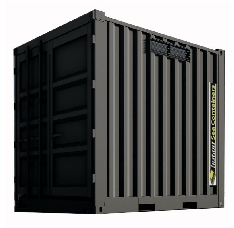
2 3D VIEW NTS