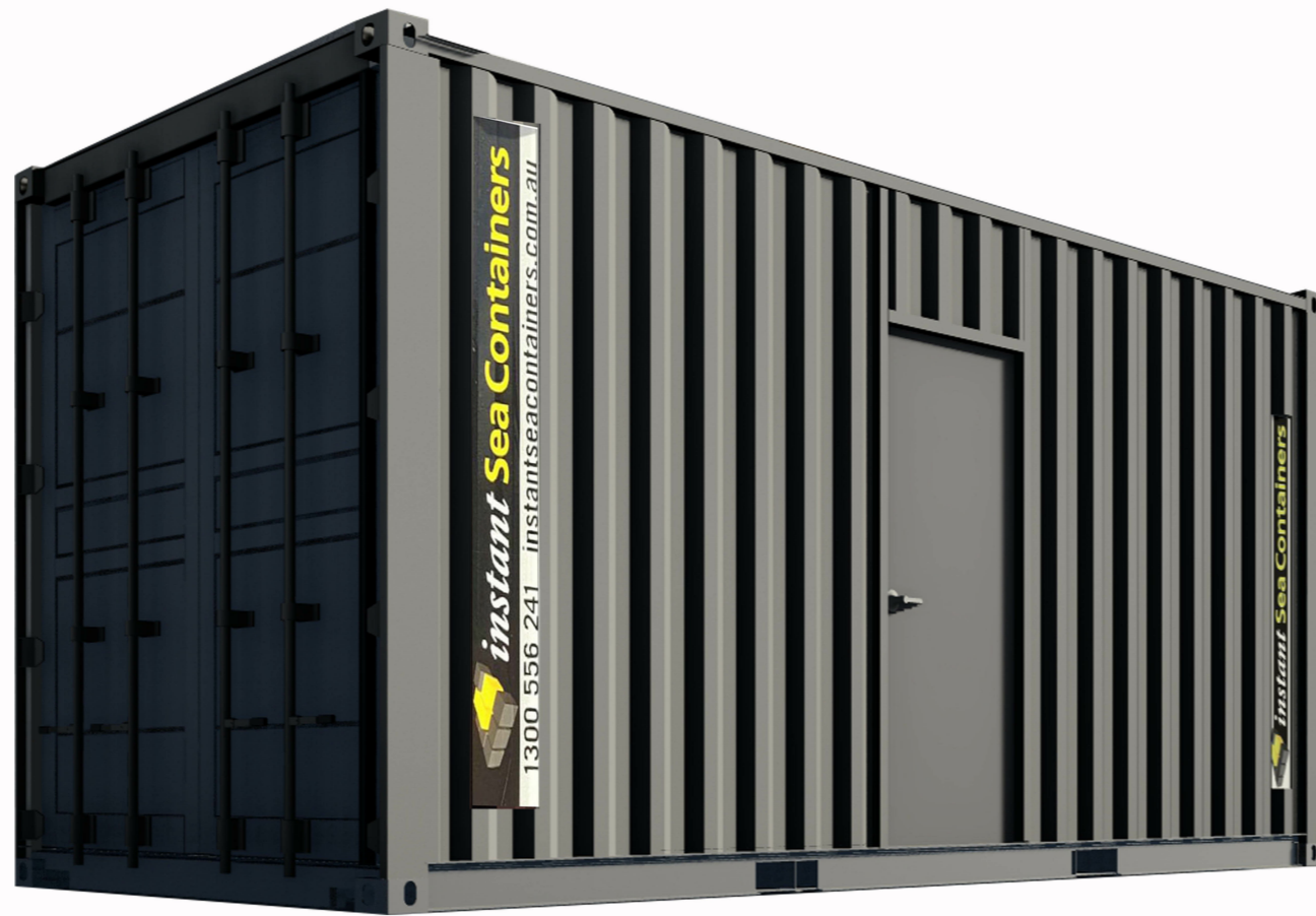
2 3D VIEW NTS