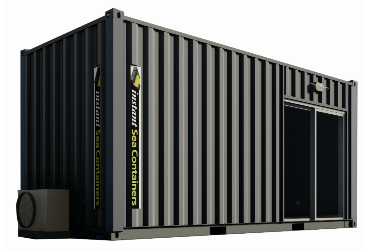
2 3D VIEW 1 : 10