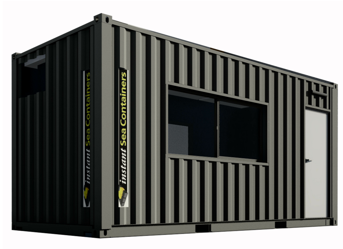
1 3D VIEW 1 : 10