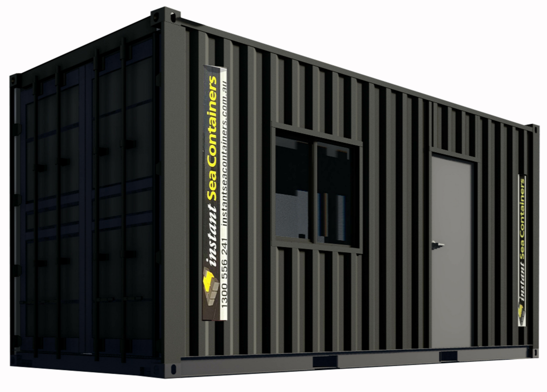
2 3D VIEW NTS