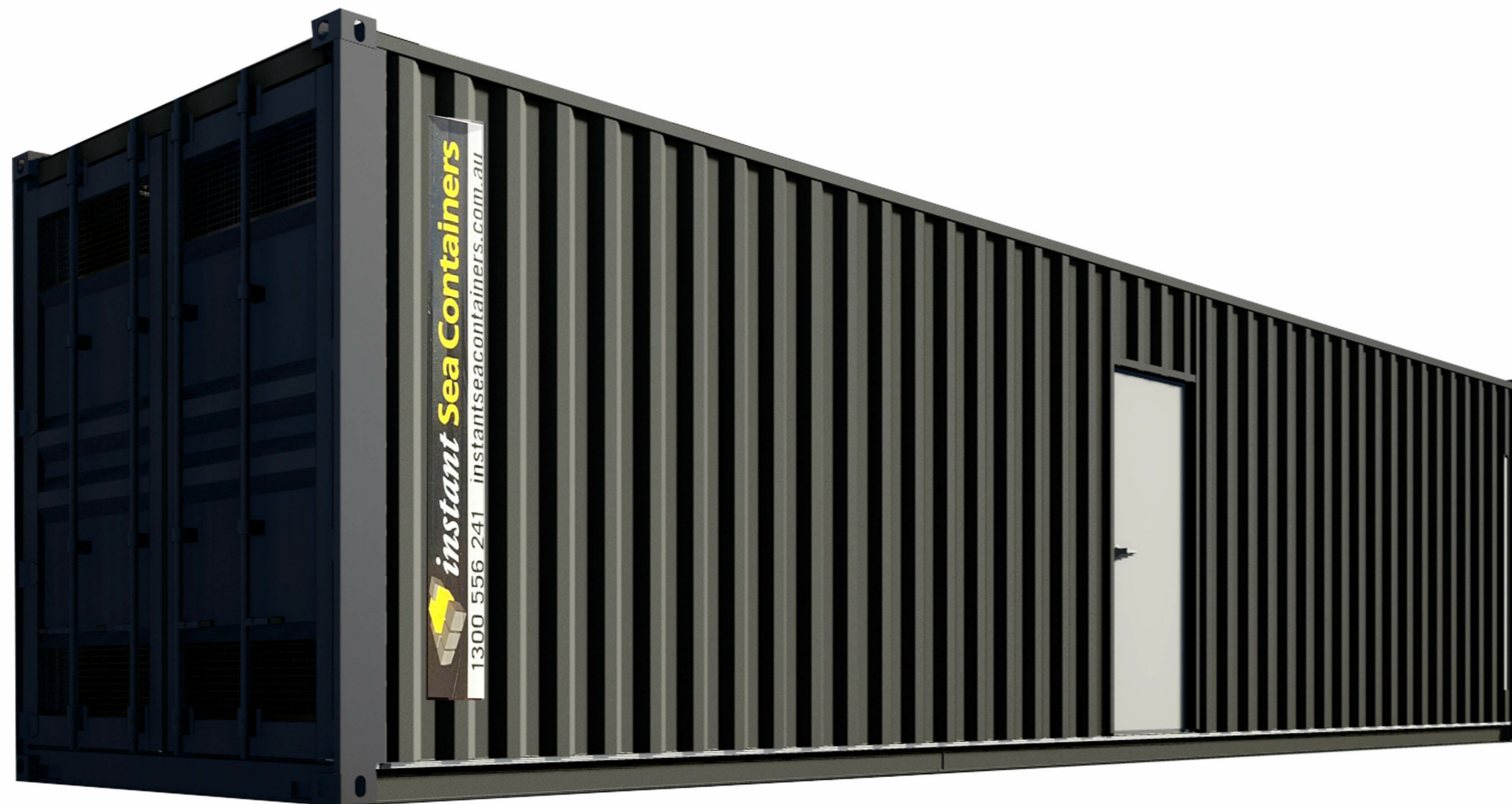
1 3D VIEW 1 : 10