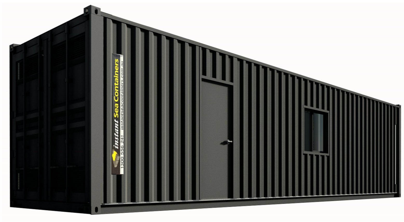
2 3D VIEW NTS