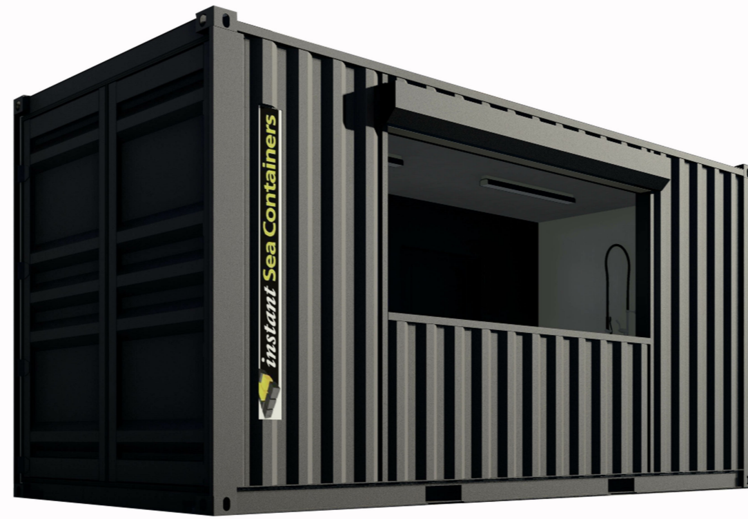
1 3D VIEW NTS