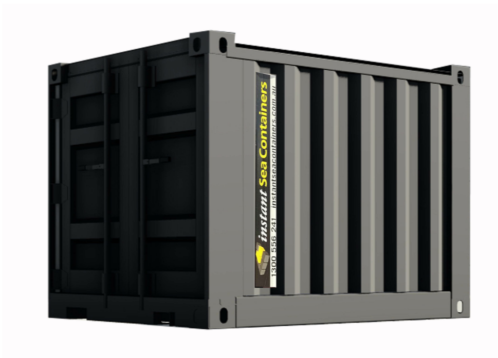
2 3D VIEW NTS