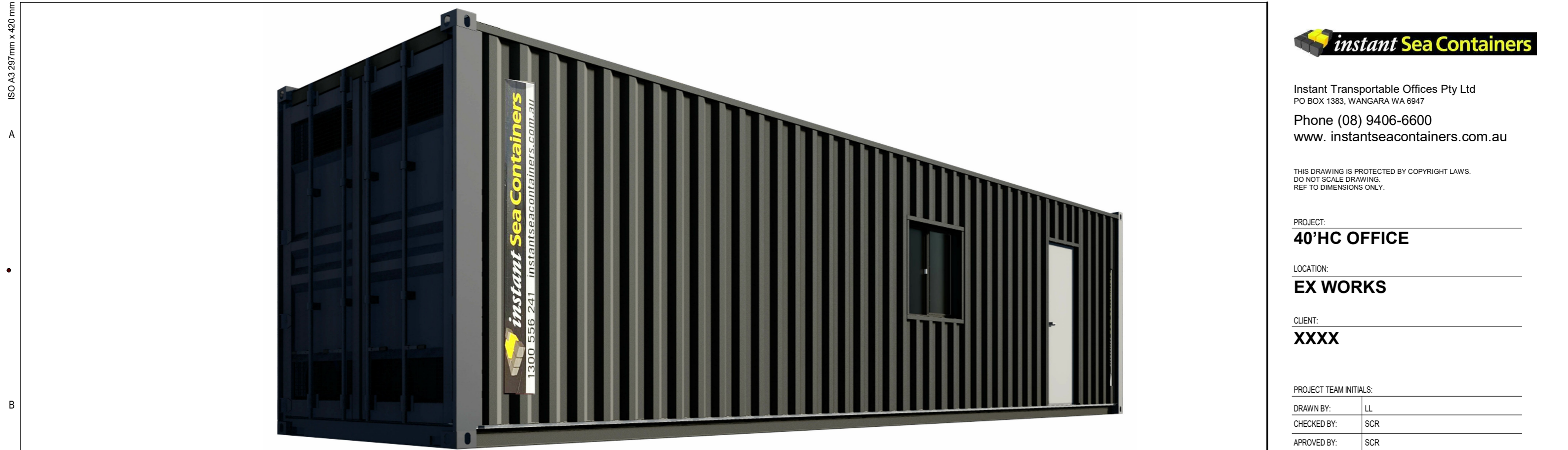
2 3D VIEW 1 : 10