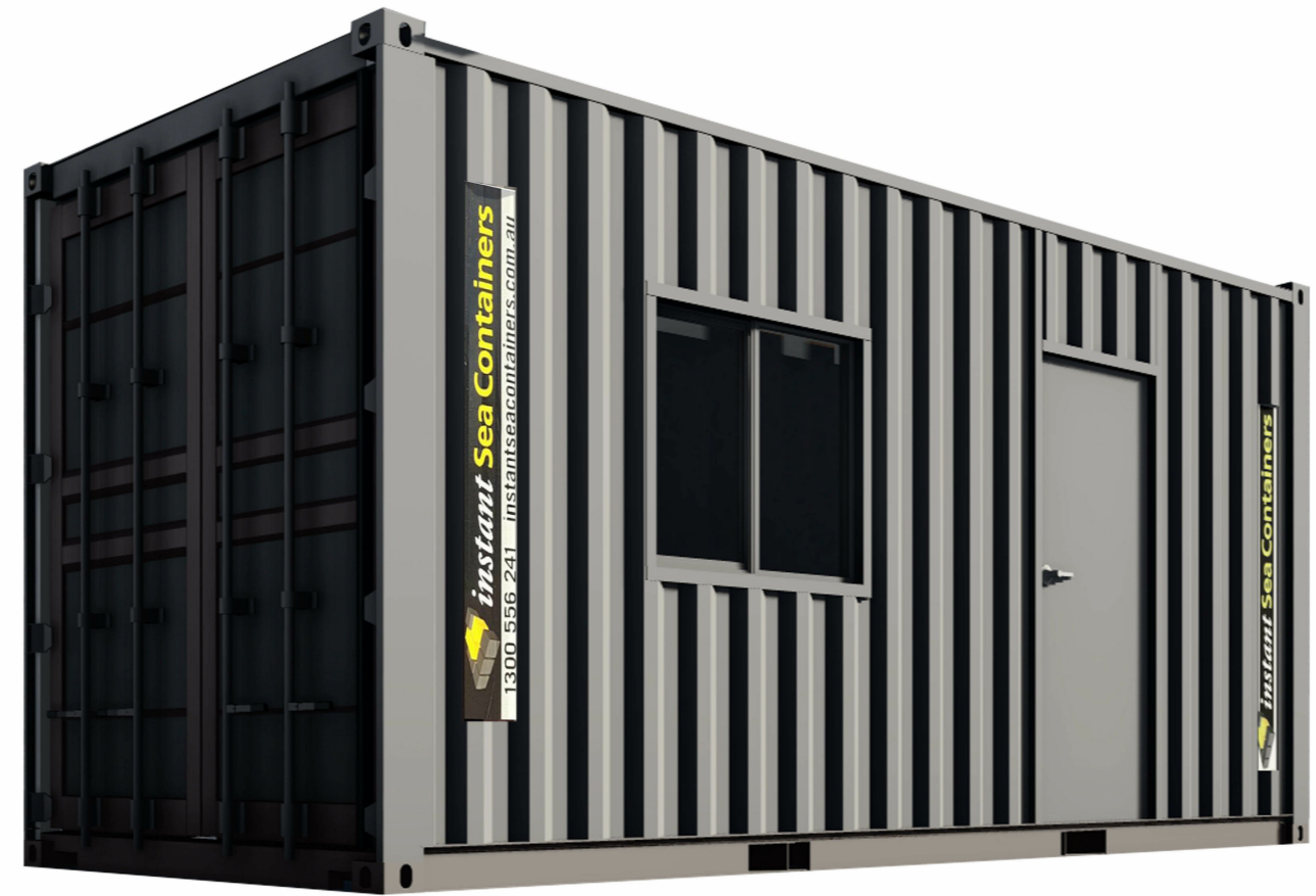
2 3D VIEW NTS