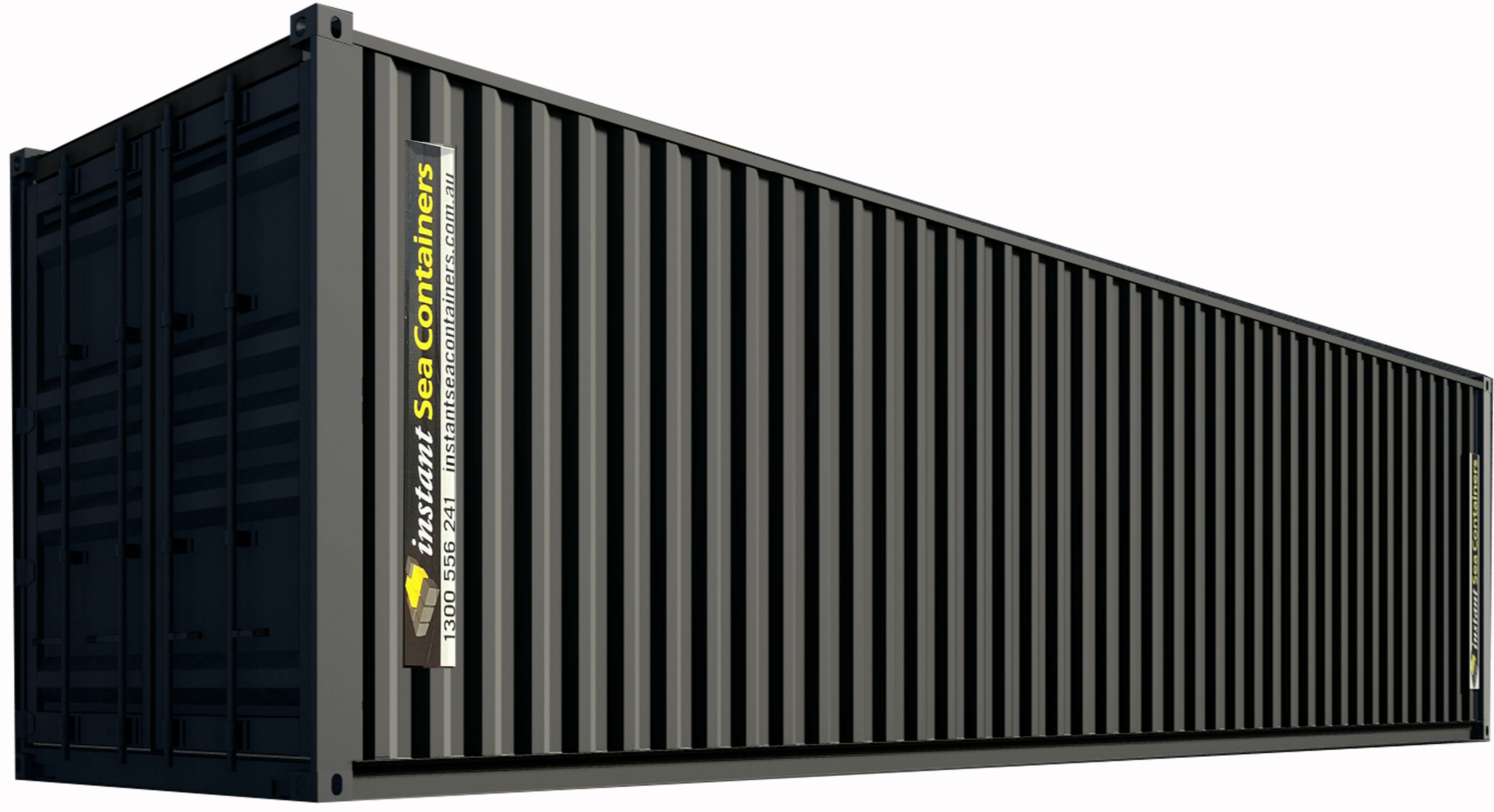
1 3D VIEW 1 : 10